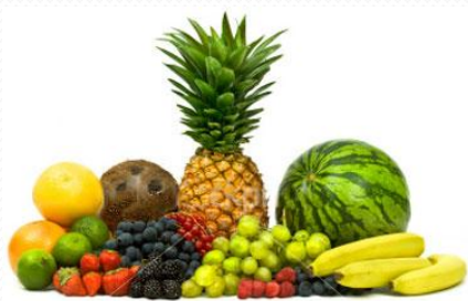
o - ovoce (fruit)