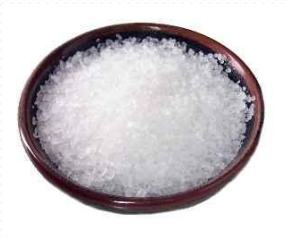
ů - sůl (salt)