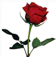
r – r ůže (a rose)