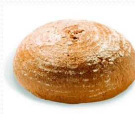
ch – chléb (bread)