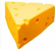
ý - sýr (cheese)