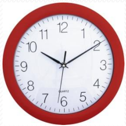
h – hodiny (a clock)