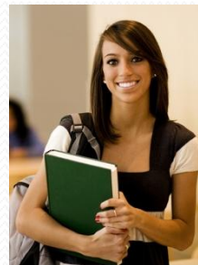
s – s tudent (a student)