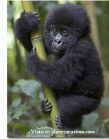
g – gorila (a gorilla)