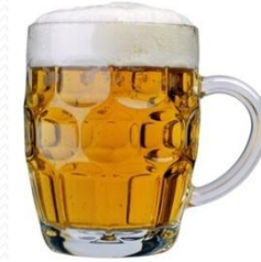
p - pivo (beer)