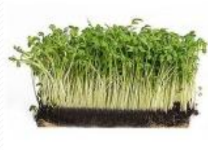
ř – ř eřicha (watercress)