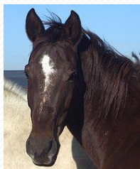
ň - kůň (a horse)