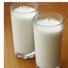
m - mléko (milk)