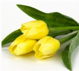
t – t ulipán (a tulip)