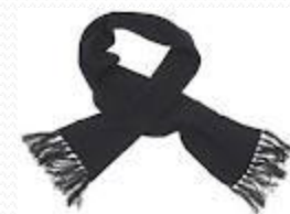
š – š ála (a scarf)