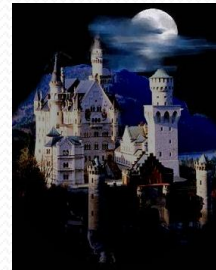
z - zámek (a chateau)