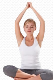
ó - jóga (yoga)