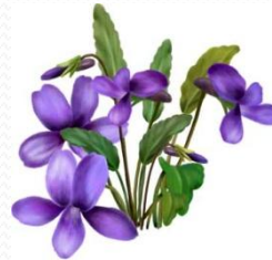
f – fialka (a violet)