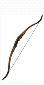
l - luk (a bow)