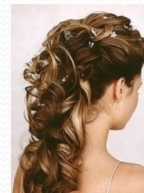
ú – ú čes (a hairstyle)