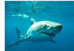
ž - žralok (a shark)