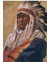
i – indián (an Indian)