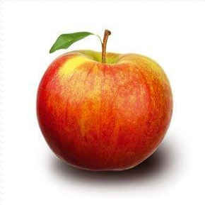
j - jablko (an apple)