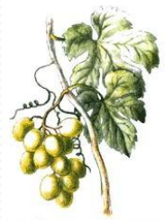
é – réva (grapevine)