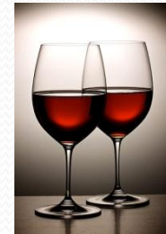
í – víno (wine)