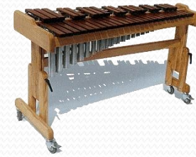
x - xylofon (a xylophone)