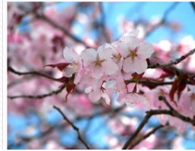
ě – květ (a blossom)