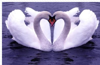
t' – l abut' ( a swan)