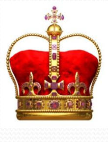
k - koruna (a crown)