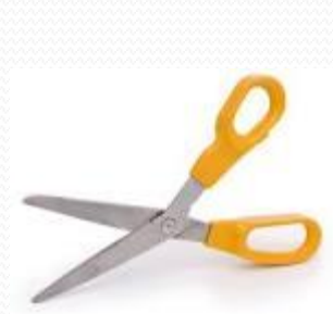
n - nůžky (scissors)