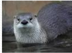
v - vydra (an otter)